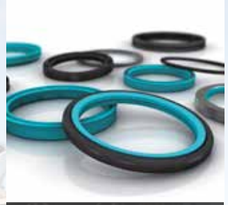
Trelleborg Sealing Solutions